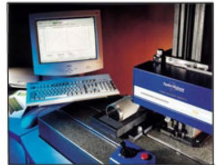
From Talysurf Series